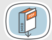
Publish to PDF