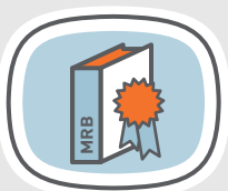
Quality Assured MRB "no errors"